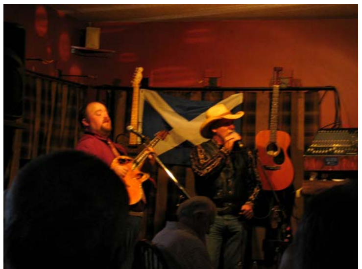
XO Stan Caught Performing C&W in BC, Canada