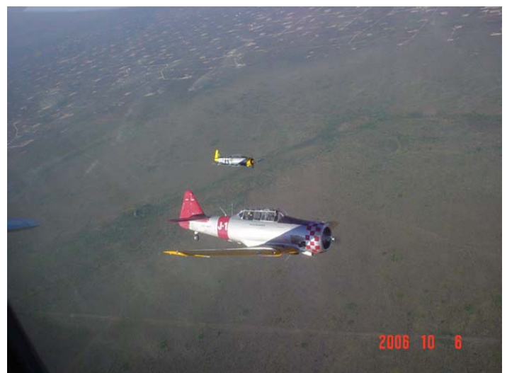
Below: Col. Stan's View In Formation