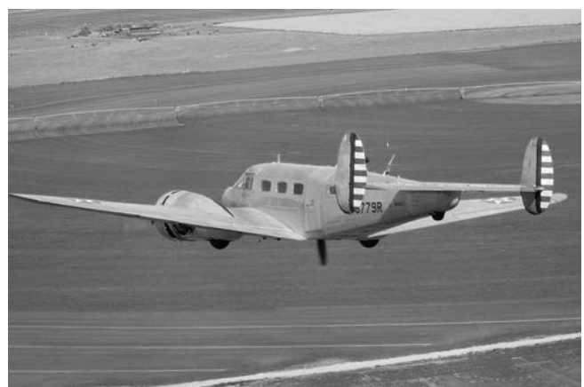
The Mile High Wing's AT-7 cruises over the open fields near Platte Valley Airport