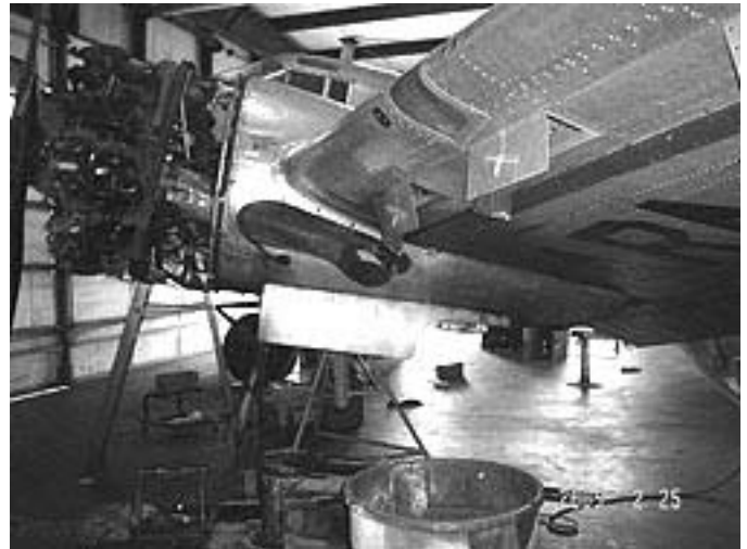
Above: The Wing's potential C-45 undergoes its annual inspection – see "Too Legit to Quit"

Finally, the Commemorative Center will provide space for the O Club. I'm sure the new O Club will be nice, but in some ways, I will miss the big tent that has been used at previous AIRSHOs. →