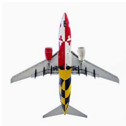
Image attached: Jeffrey Milstein, Southwest Airlines Maryland One Boeing 737-700, 2007 , pigment inkjet prints, 40 x 40 inches, collection of the artist, courtesy Paul Kopeikin Gallery

August 23-December 19 at Wichita State University's Ulrich Museum: The Jet as Art.