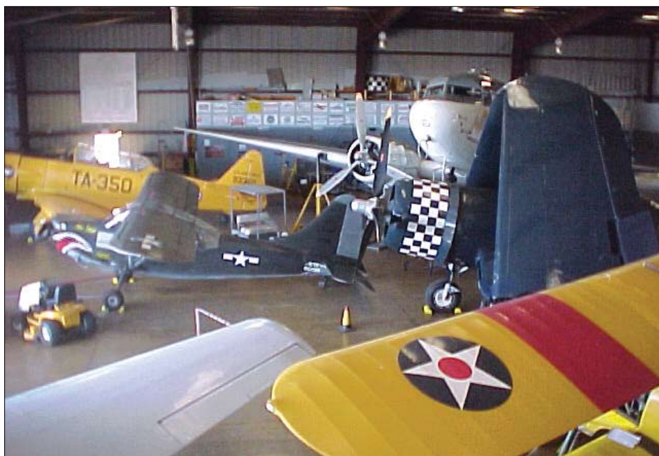
The DFW Wing hangar is crowded and we need all hands on deck to help keep the hangar clean and organized. Come out today and see how you can help make a difference.

Sometimes it is difficult to know how you can help as a volunteer – don't be shy – just ask one of the members working on something if you can help. Even if you have no mechanical expertise there are things you can do to assist with the process of getting our aircraft ready for 2010 and our "seasoned" members can direct you. Let's all get involved in 2010 – Remember that the more you put into an organization or activity the more you will get out of it so – come on out to "Navy Lancaster" and have some fun.