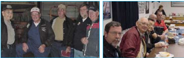
If you were not at the February Wing Meeting, you missed out on a good time.

See you at Winter Staff Conference in Midland. I'll be taking names!